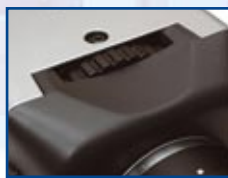
Back focus thumbwheel