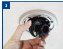
Position camera with 3-axis GyroView