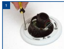
Tighten the fixing clamps