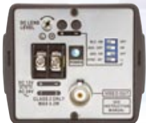
Fast simple installation