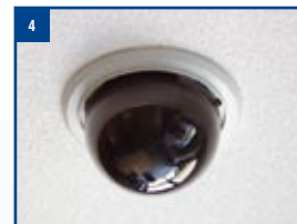
Attach the bubble