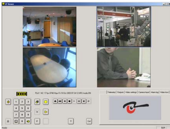
Baxall's digital viewer software

On-board camera intelligence provide fast plug-and-play installations